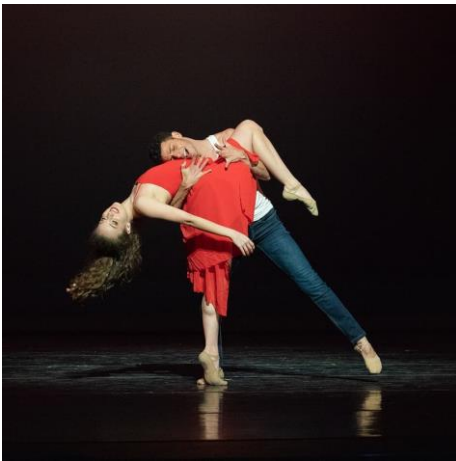
Life in the Fast Lane