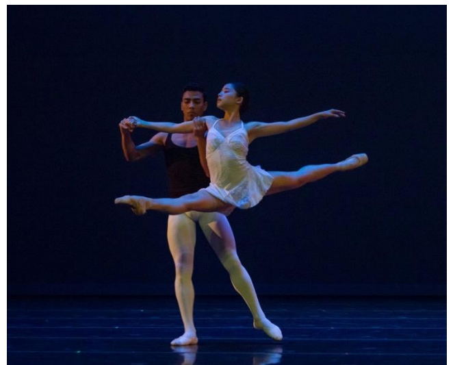
Claire de Lune